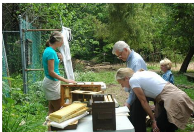
Bee Keeping Demo at the Cylburn hive