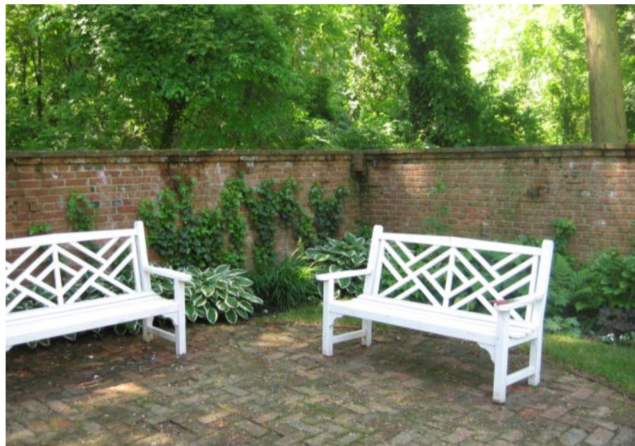
Evergreen Mansion “Friendship Garden” ~ Cliff Dwellers Garden Club