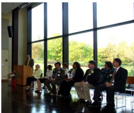
May 1st Reception at the Vollmer Center

This gift was matched by the City of Baltimore, and further funding was made available by the Federated Garden Clubs of Maryland, The Horticultural Society of Maryland, and Cylburn Arboretum Association.