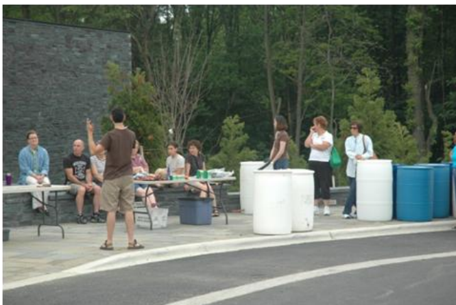
Rain Barrel Workshop at the Vollmer Center

The happy collaboration of Districts III & IV in the ' Revere-Reduce-Reuse ' Seminar and Standard Flower Show benefited from gorgeous weather on May 22 - 23 at Cylburn. Special Exhibits and presentations led by Master Gardeners, community gardeners and other experts drew lots of visitors, with the rain barrel, youth and beekeeping demonstrations being hugely popular. The Flower Show's Design and Horticulture divisions at the Mansion and Greenhouse Classroom got plenty of foot traffic too, with talented exhibitors showcasing their best garden performers and innovative designs. Congratulations to the many ribbon winners, and heartfelt thanks to the worker bees, entrants, and attendees who made it possible!